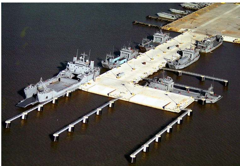
Naval vessels berthed at the completed pier

We achieved substantial completion for this project in September 2004. Throughout the construction period, the wharf and surrounding piers had to remain in operation. All of our activities were performed in a manner that minimized interference with the normal operations of the activity and other piers.